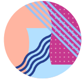
Textiles & fibers