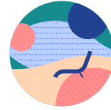
Home sport & leisure