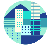
Building & construction