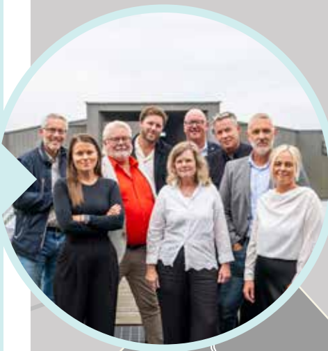
The Blekinge Establishment Group consists of Business Blekinge, Region Blekinge, and establishment managers from Blekinge's five municipalities.

THE CONDITIONS FOR Blekinge's development have changed rapidly, and one reason for this positive shift is the strong leadership shown by Blekinge's politicians. The commitment to the SouthEast Rail Link is clear evidence of this.