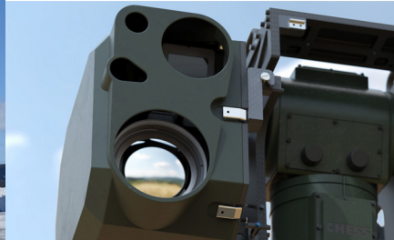
HD day camera & continuous zoom cooled TI