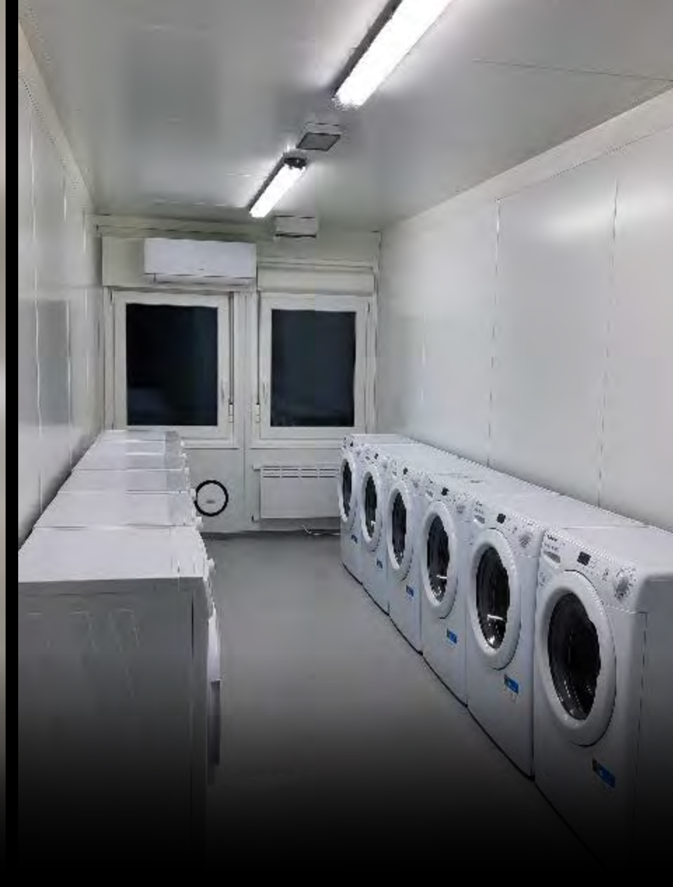
Laundry and drying room – design examples