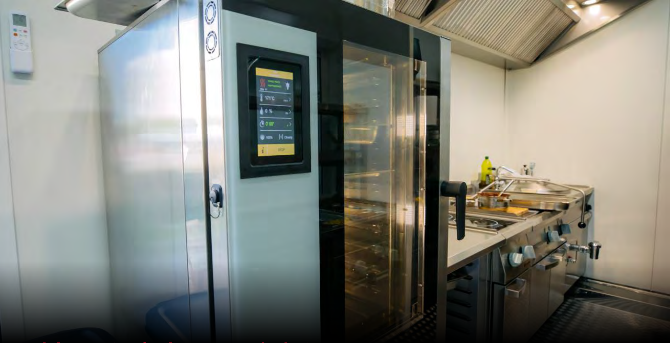
Mobile catering facility – example design