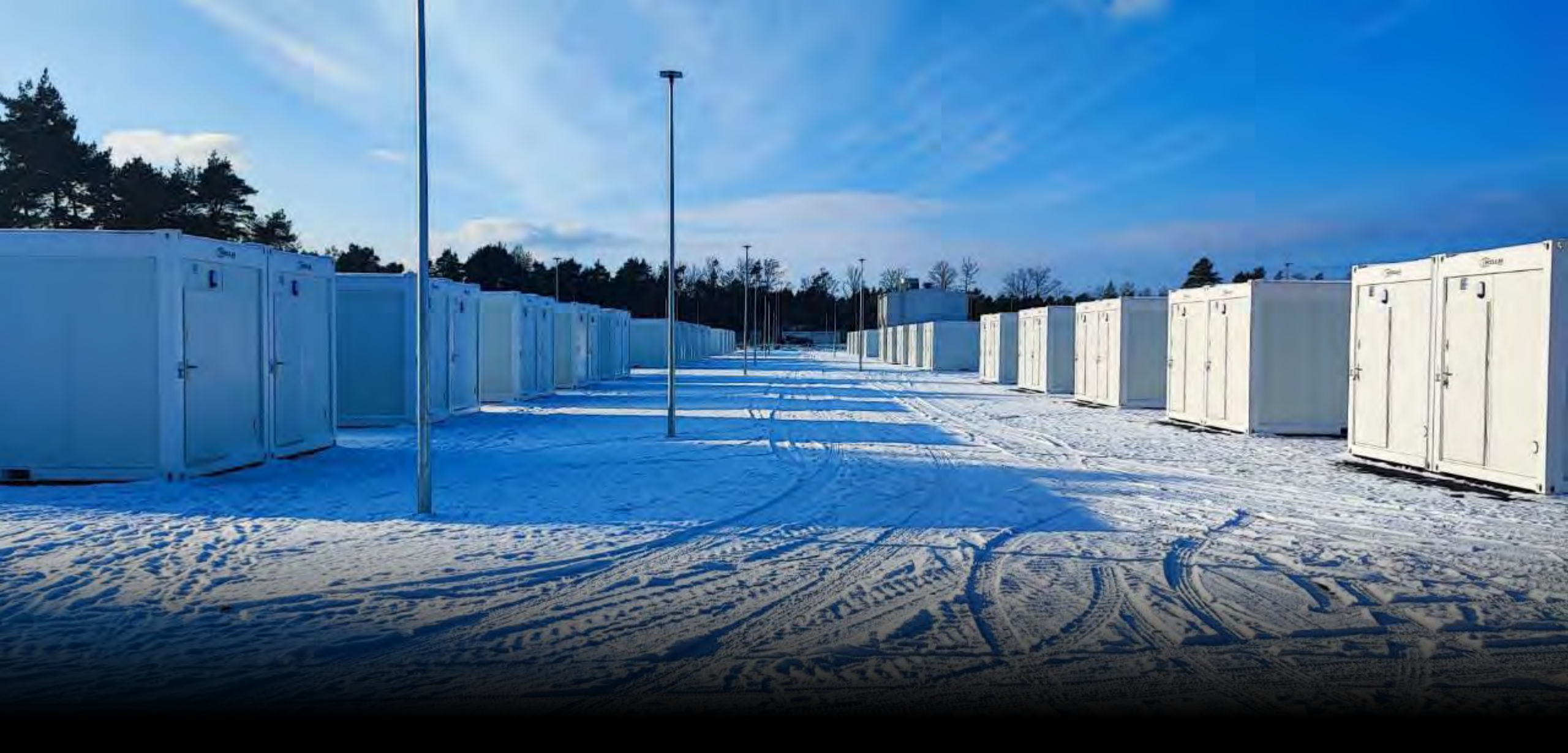
Residential buildings, example of realization – Żagań, military facilities for the Land Forces Academy from Wrocław. 189 container systems