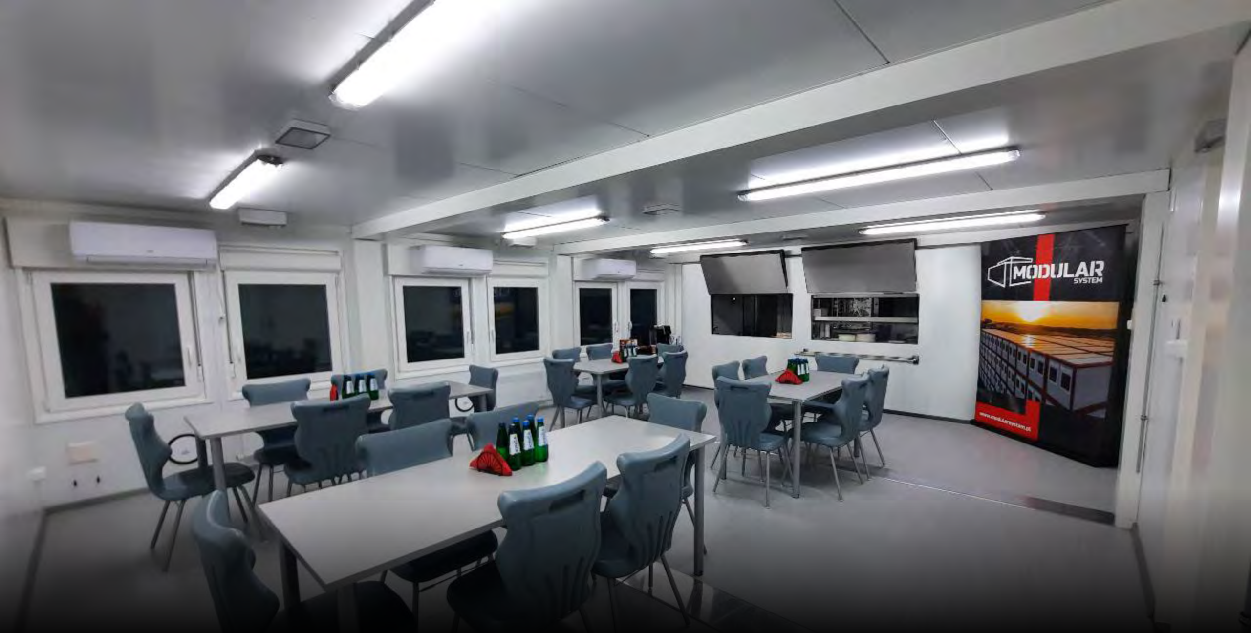
Mobile catering facility – example design