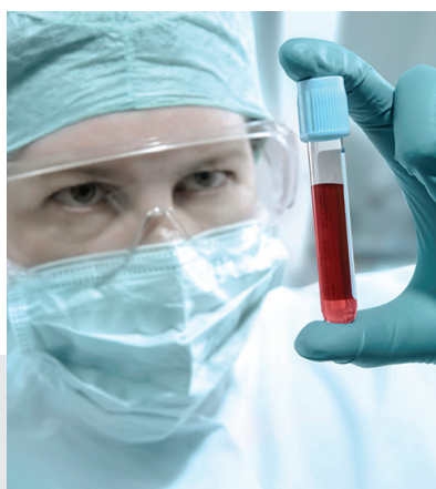
Assembly of laboratory test tubes