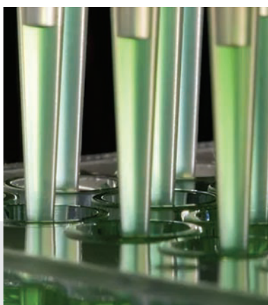
Liquid pipetting process