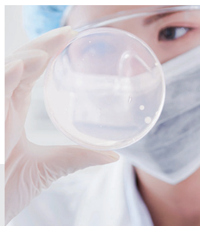
Petri dish automation