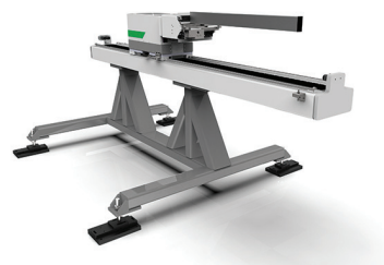
Automation of receipt and insertion