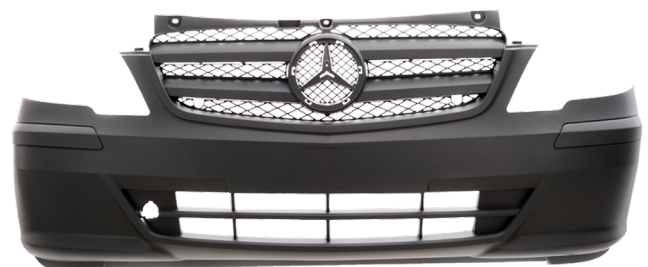
Facias and Grilles