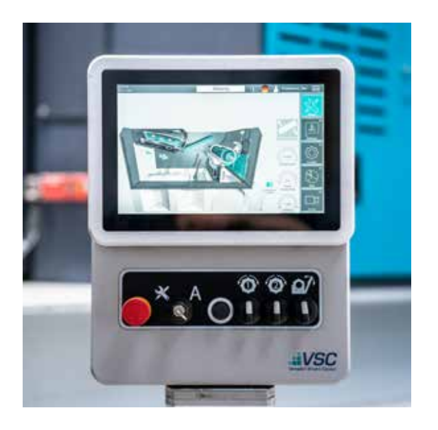
VSC.control Operating panel

The VSC.control panel was designed for control cabinet installation and as an operating panel.