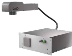
HIGH-QUALITY CAJO LASER