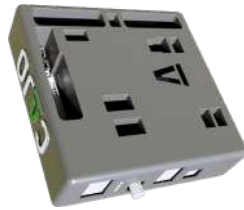
POWERFUL CONTROL BOARD