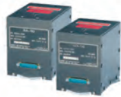
Inertial measurement units (FOG)