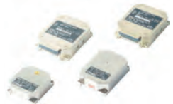
Fibre optic gyroscope family