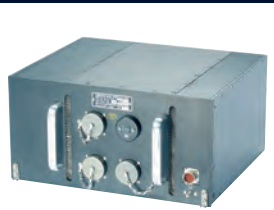
Tornado Main Computer

The Main Computer is the central processing unit of the avionic system and is responsible for controlling the cockpit displays, executing navigation calculations, weapon control and controlling data transfer between the avionic subsystems.