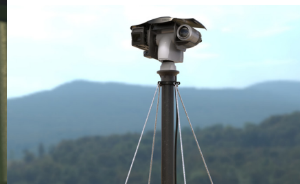
HD day camera & continuous zoom cooled TI