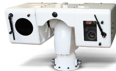
HD day camera & continuous zoom cooled TI