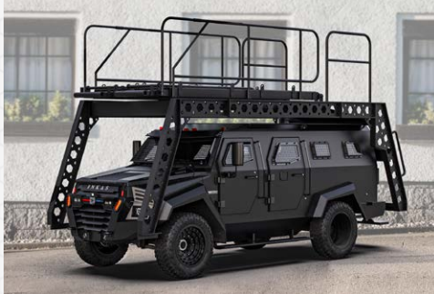
TACTICAL INTERVENTION VEHICLE