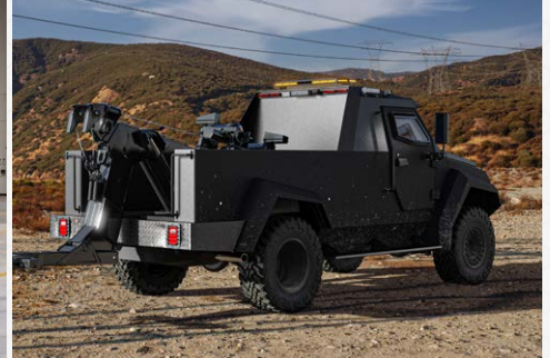
ARMORED RECOVERY VEHICLE