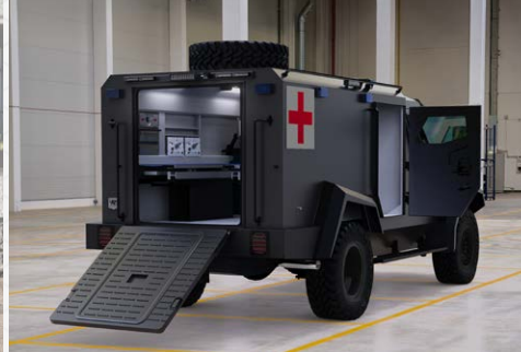
MEDICAL EVACUATION VEHICLE