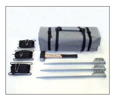
Top Guy Kit