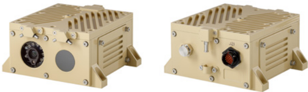
ADSC-90 Dual Sensor Camera