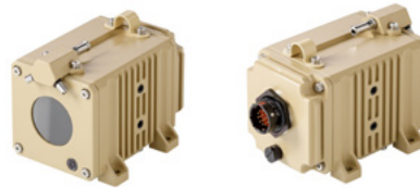
ATIC Thermal Imaging Camera