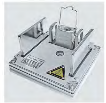
Mica Plate Heater

Designed for industrial processes such as plastics manufacturing, matrixes, equipment heating, liquid heating, and several other applications.