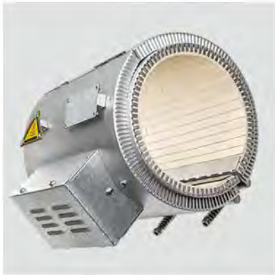
Ceramic band heaters