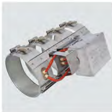
Mica Heat-Cool Combinations