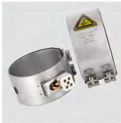
Mica band heaters