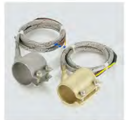
Band heaters for nozzles