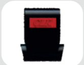
• Lock Options with and without a key