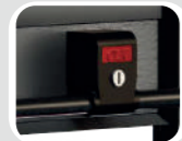
• Company-Specific Logo Option