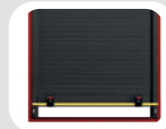
• Color Options