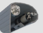
• Drum and Drumless Option