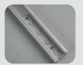
• LED Lighting Option