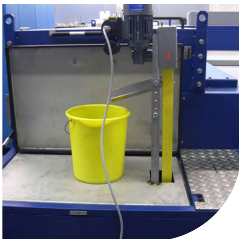
Oil skimmer BS at degreasing plant

The deflection roll is designed in such a way that dirt particles and oil are pressed into the grooves of the roller. This allows coarser chips to be carried along without lifting the belt off the conveyor roll. The bearing of the deflection rollers is sealed so that dirt particles cannot enter the bearing. Since the belt is guided vertically onto the liquid surface, the BS oil skimmer requires only a very little installation space. In confined spaces, it is possible to use the oil skimmer at an angle of up to 45 °C, as the lower deflection roll is attached to the body of the oil skimmer.