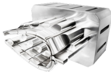
MULTI-PART HORN FOR LARGE COMPONENTS

The right device for every application. We provide you with tailored technology. Contact us and we will be happy to advise you.