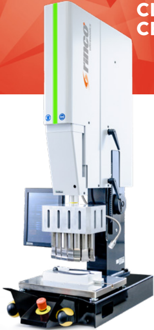
ELECTRICAL MOTION CLEANROOM