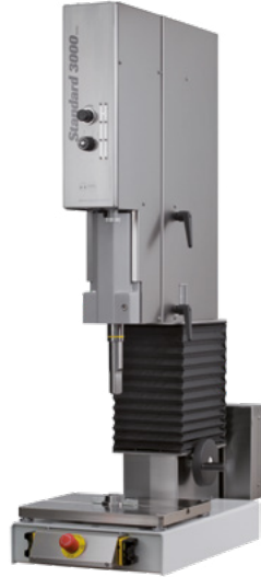
STANDARD 3000 CLEANROOM

Since its foundation in 1976, RINCO ULTRASONICS has been developing and constructing machines and generators, as well as components and tools, to the highest levels of precision and quality for ultrasonic solutions.