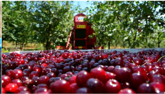
SOUR CHERRY & PLUM