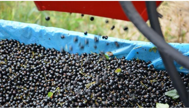
CURRENT & BERRY